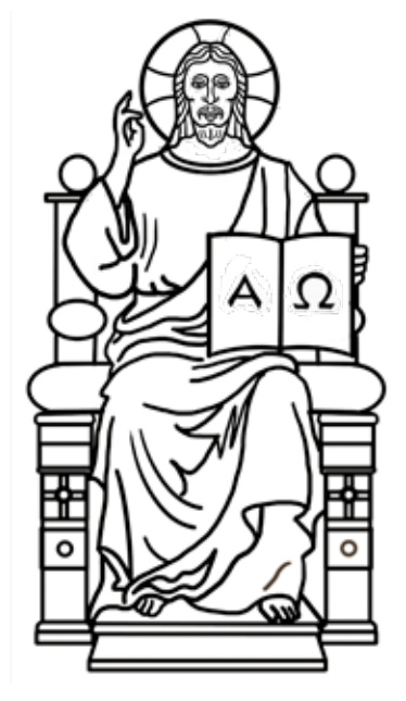
Jesus, the king, is coming soon.

John receives a message from Jesus, reminding him that he is the everlasting king who is coming soon, and that all who long for him, if they come to him, are accepted, for everyone belongs to God's family.