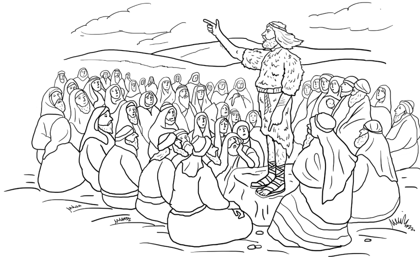
John tells the crowds about Jesus.

John prepares the way for Jesus, making it clear that Jesus will be for all people.